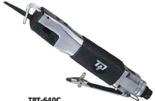
TPT-640C Air Body Saw(Rear Exhaust)