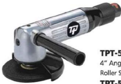
TPT-507R 4" Angle Grinder, M10 x 1.5, Roller Switch TPT-507R-B with 5" disc, M14 x 2