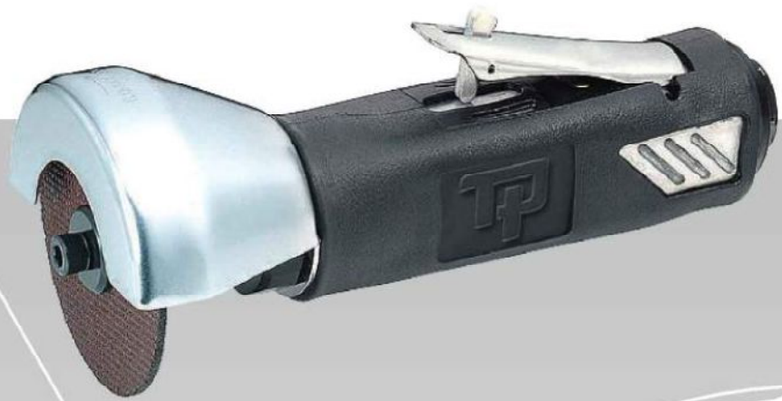
TPT-530 Heavy Duty Wheel Grinder