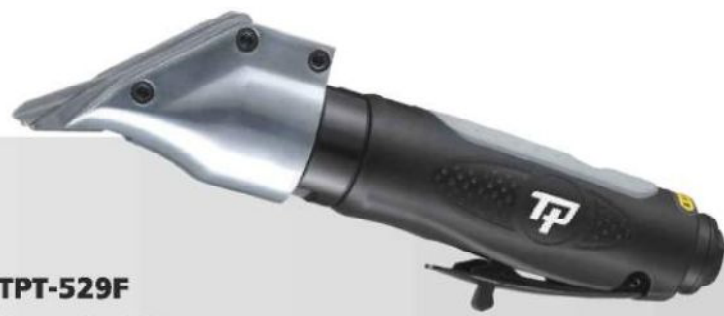
TPT-529F Composite Air Shear