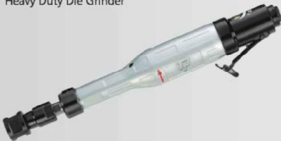
TPT-531-B Heavy Duty Die Grinder