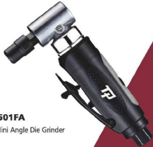
TPT-501FA 1/4" Mini Angle Die Grinder