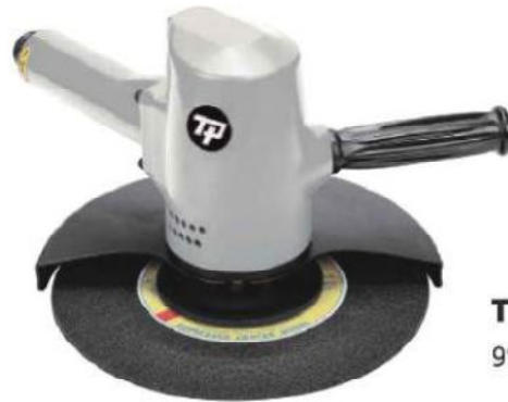
TPT-911 9" Vertical Grinder