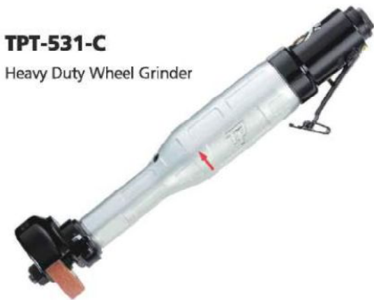
TPT-531-C Heavy Duty Wheel Grinder