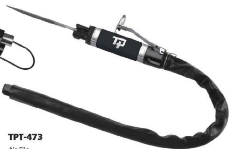
TPT-473 Air File