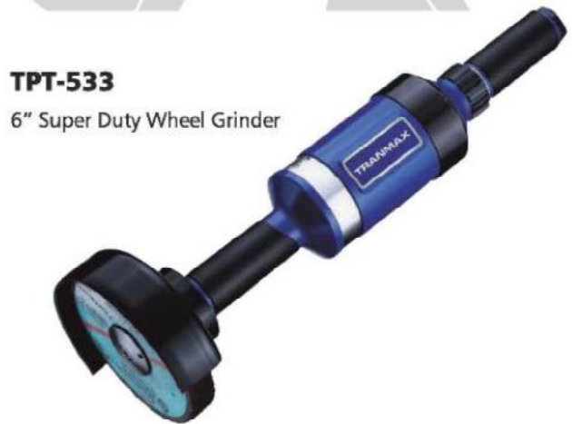
TPT-533 6" Super Duty Wheel Grinder