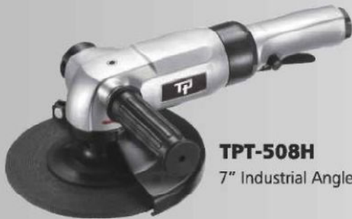
TPT-508H 7" Industrial Angle Grinder