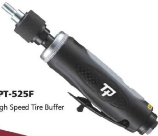
TPT-525F High Speed Tire Buffer