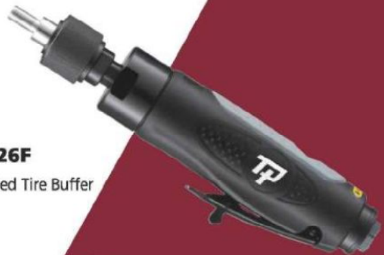
TPT-526F Low Speed Tire Buffer