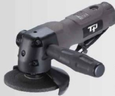
TPT-509 4" Angle 100° Grinder, 3/8" -24 TPT-509-B with 5" disc, M14 x 2