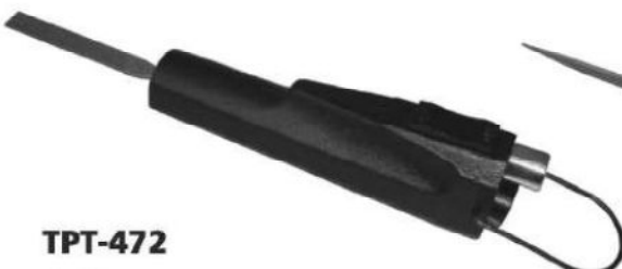
TPT-472 Air File