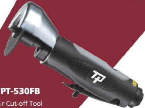
TPT-530FB Air Cut-off Tool