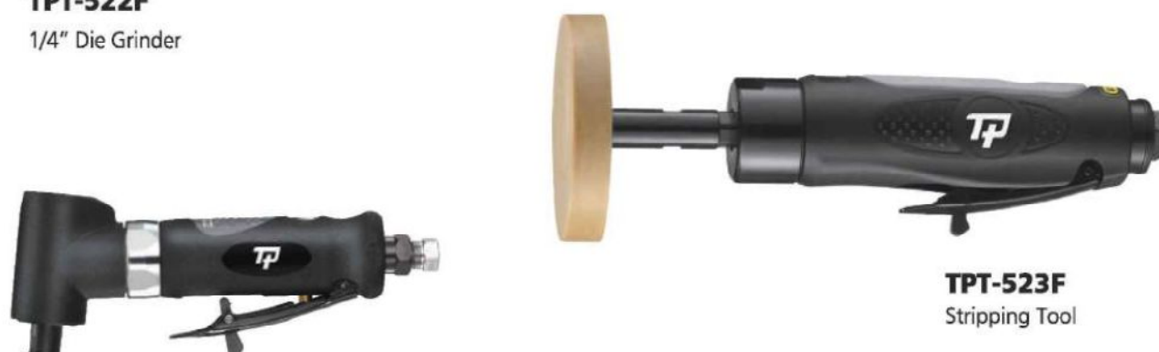
TPT-523F Stripping Tool