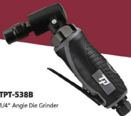
TPT-538B 1/4" Angle Die Grinder