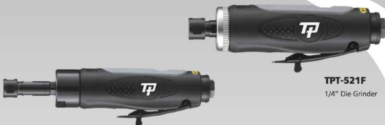
TPT-521F 1/4" Die Grinder