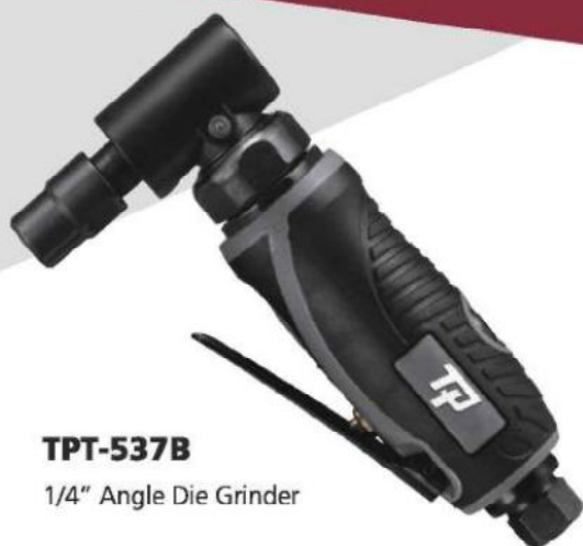
TPT-537B 1/4" Angle Die Grinder