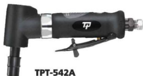
TPT-542A 1/4" Angle 97° Die Grinder