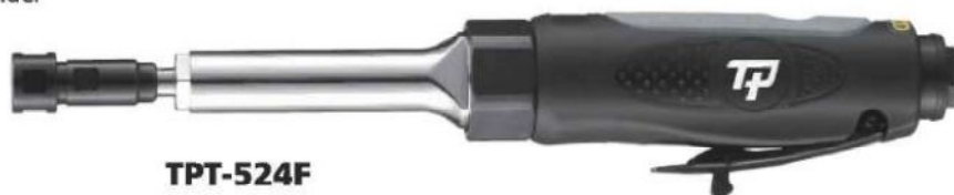
TPT-524F 1/4" Die Grinder Extended