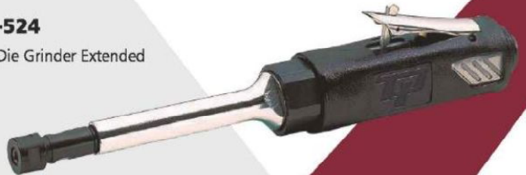
TPT-524 1/4" Die Grinder Extended