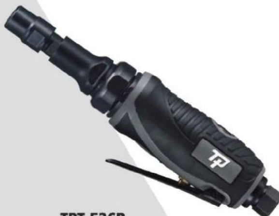
TPT-536B 1/4" Die Grinder