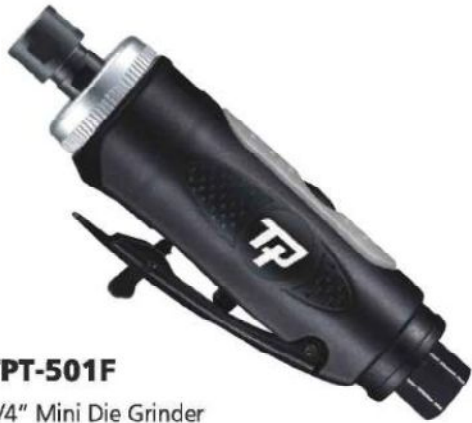
TPT-501F 1/4" Mini Die Grinder