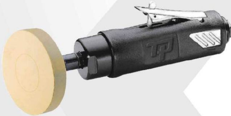
TPT-524 1/4" Die Grinder Extended