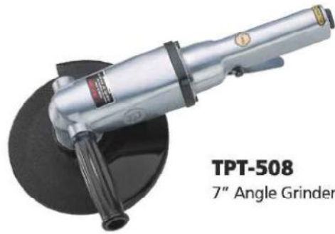
TPT-508 7" Angle Grinder