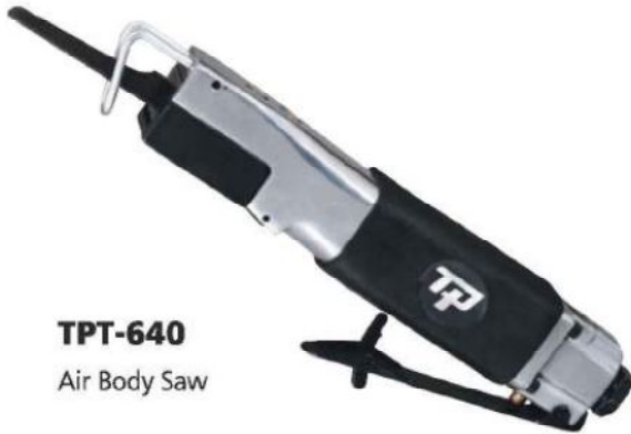
TPT-640 Air Body Saw