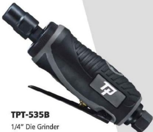
TPT-535B 1/4" Die Grinder