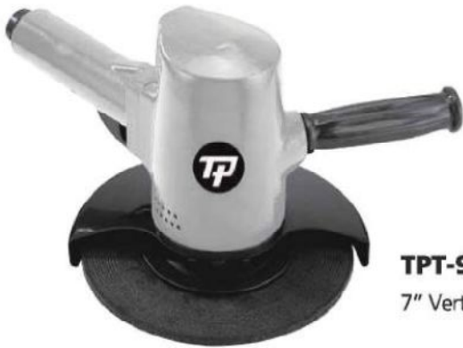
TPT-910 7" Vertical Grinder