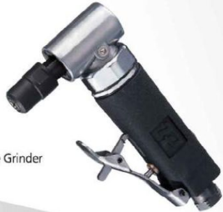
TPT-501A 1/4" Mini Angle Die Grinder